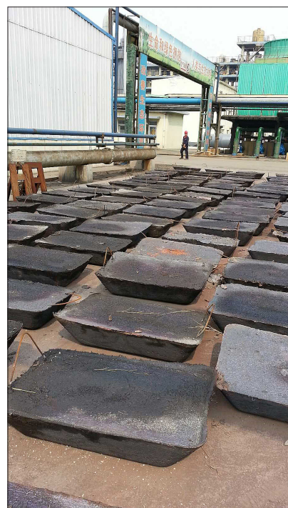
Figure 2. Copper blister.