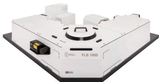
Figure 1. FLS1000 Photoluminescence Spectrometer

The measurement of fluorescence lifetimes provides a wealth of information on the sample under study, from charge-carrier lifetimes in semiconductors to the local environment of biomolecules in living cells. In many of these studies, short fluorescence lifetimes on a picosecond timescale are required to be measured. In this application note, the measurement of sub 20 picosecond lifetimes utilising the FLS1000 Photoluminescence Spectrometer equipped with a hybrid photodetector is demonstrated, and the impact that the configuration of the FLS1000 has on the minimum lifetime that can be measured is discussed.